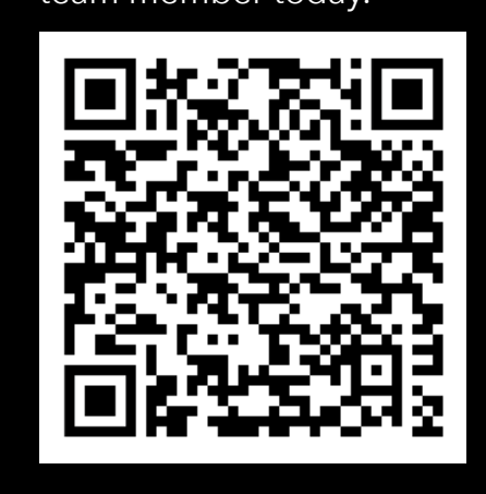
Want to learn more? Connect with an Eye Care team member today.

Join us, and let's see your vision through.