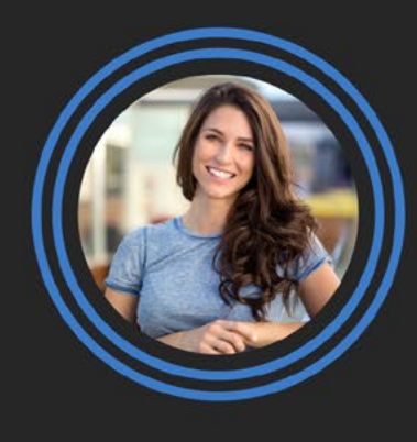
PRK Best for 18-42 Year Olds