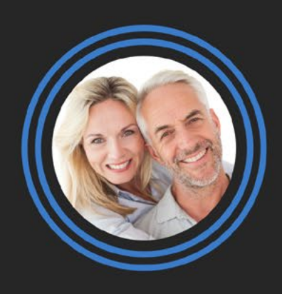
RLE Best for 43-60 Year Olds