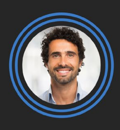
EVO ICL Best for 21-42 Year Olds