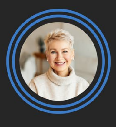
CATARACT Best for 60+ Year Olds